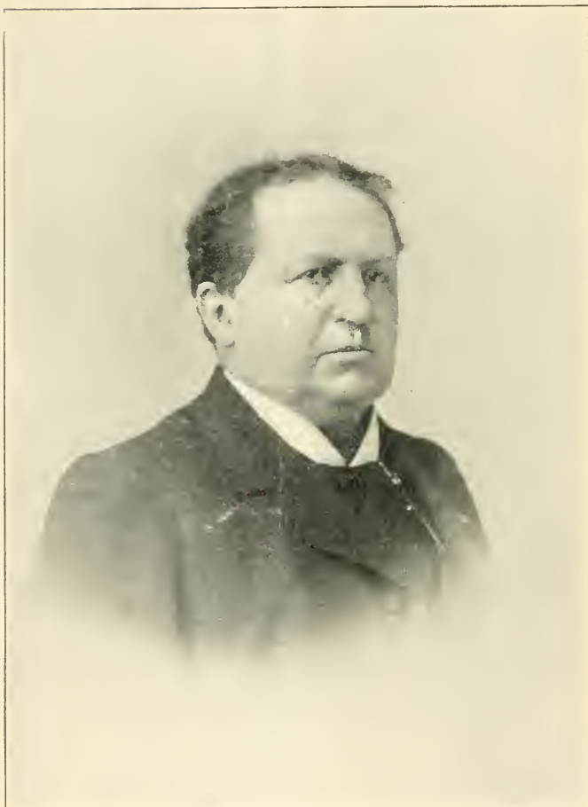
DR. ABRAHAM KUYPER.