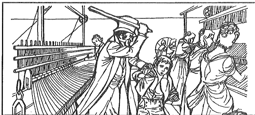
19th century textile mill in England.

The CLAC does not condemn the attempts of individual Christians to make the very best of it in the pragmatic, materialistically oriented unions that dominate the labour scene. It throws out the