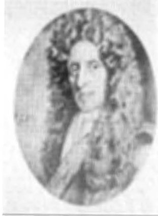
John Locke (1632-1704)

technological apparatus that we devised since 1800 to take over the work of our hands is indeed unholy, unworthy of the dignity of God's image bearers. For one thing, it has proved to be an illusion to eliminate man entirely from the labour process. Millions are still involved in industrial production, and increasing millions are required for the production of leisure. But their involvement in the labour process is, in many cases, humanly demeaning, alienating. The machine that we have devised thus contributes to the further deterioration of man's creaturely status. This is not an inherent fault of the machine, but