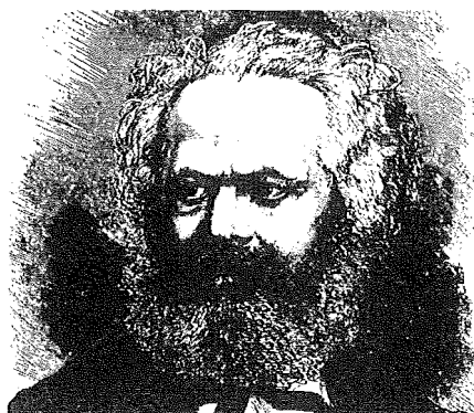
Karl Marx (1818-1883)

in 1917, and in China in 1949. The conservative wing—the right—though it is fundamentally “modernistic” in outlook since it takes history as its autonomous guide, prefers to slow down the process of secularization and modernization. The moderate, liberal wing of modernity—the centre—wants to make sure that the social order indeed finds its basis in the will of man, preferably the individual will, but it wants to establish certain limits on the expression of that individual will so that the fruits of past civilizations are not entirely eliminated and that the common good is not entirely left out of consideration. What is left, centre,