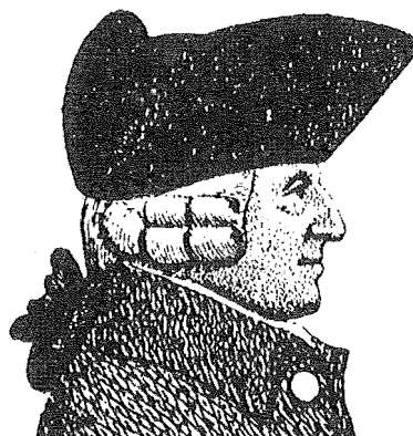
Adam Smith (1723-1790)

In the Bible labour is given a dignity in the affairs of men, alongside of other facets of the human condition—worship, the rearing of children, the care of the poor, doing justice in the gates of the city, etc. Labour, like the rest of life, is considered holy before the Lord. God placed man in the Garden of Eden to till and to keep it. Work is a divine mandate, a sacred calling, to fill the needs of men and women, children and children’s